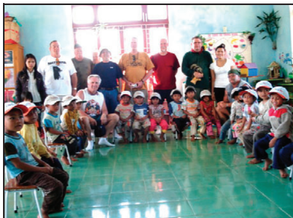
Team visits kindergarten classroom

Looking back on my decision to join VVRP, I feel I have come full circle with my Vietnam experience—from surviving and witnessing death and destruction during my tour of duty in the 60's to coming back 42 years later and helping rebuild the country. Taking action can be a powerful thing. I believe I have received a spiritual healing because of becoming a VVRP team member. In the end, it's all about the children and their future.