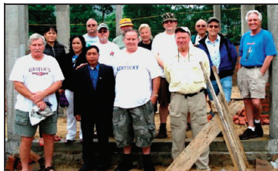
Team XXIV at A Ngo

Like the three previous teams VVRP has sent to the region, Team XXIV was very warmly received by the Vietnamese. This newsletter recounts the experience of the team members in their own words and pictures.