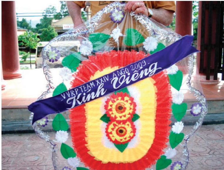
Wreath place at A Luoi Veterans Memorial Cemetery by members of Team XXIV to honor fallen Vietnamese soldiers