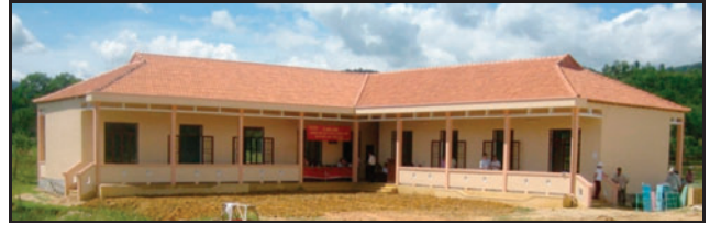
Team XXIII—Completed A Dot primary school

ful for the opportunity I've had to serve as a member and officer of the VVRP board. I extend my heartfelt thanks to these dedicated board members, team members, and, especially, to our donors for their support in furthering our mission of healing.