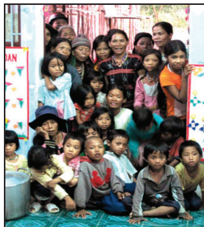
Ta Oi friends

This trip was my best. Sometimes I cried. Sometimes I prayed. And sometimes I smiled and laughed. Going back helps you to heal inside, and it even makes your dreams not so frightening. You can chase all those bad memories with new and cheerful ones. You can lay to rest the giants of your dreams and the stressors of war.